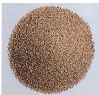
● Somelite SL (Silver coated coral sand)