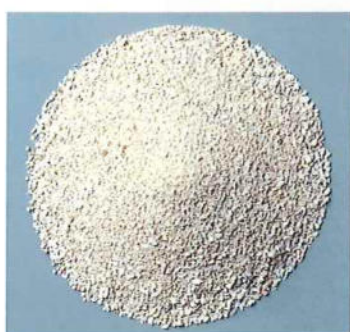
● Somelite BL (Standard)

When coral sand is used as a water-purifying agent, its minerals flow into the water creating mineral water. At the same time, it turns acidic tap water to slightly alkaline and removes the bleach odor from it. Moreover, since coral sand is a porous substance with innumerable minute holes of 10 microns or less, it also removes foreign matter and more.